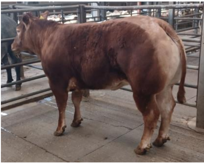
455p/kg for 580kg (£2639.00) from RC Evans Curdale

Please ensure all VAN numbers are available when booking in your sheep and cattle VAN numbers are only valid for 12 months from date of issue, ensure yours is up-to-date